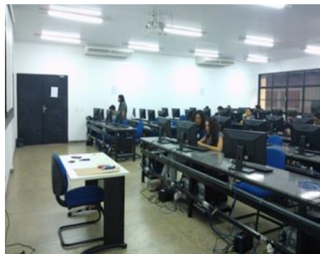
Figure 1. Classroom with VDT

This study was carried out in a classroom (Figure 1), equipped with an air conditioning system, Video Display Terminals (VDT), computers and wireless technology, in a public university in the city of Teresina, in the state of Piauí, in the Northeast Brazilian.